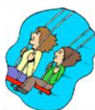
Go on swings