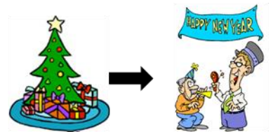
Christmas to New Years' Day