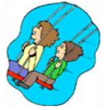
Go on swings