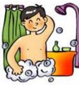
Take a shower