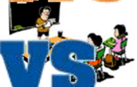
Give the lesson