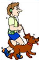
Walk the dog